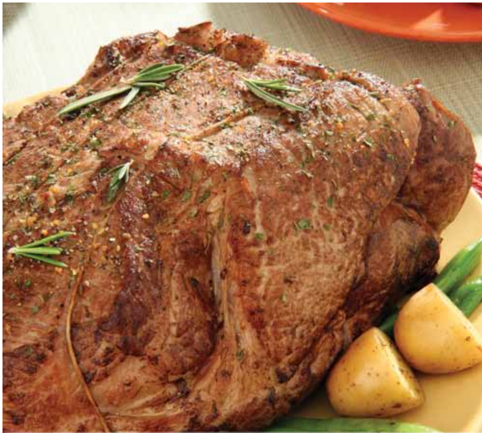
Boston Butt Pork Roast Per Lb.