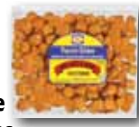
Strips, Nuggets, or Popcorn Fast Fixin Breaded Chicken 27.5 To 32-Oz.