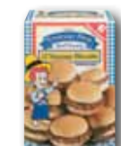
Assorted Tennessee Pride Breakfast Entrees 13.7 To 19.2-Oz.