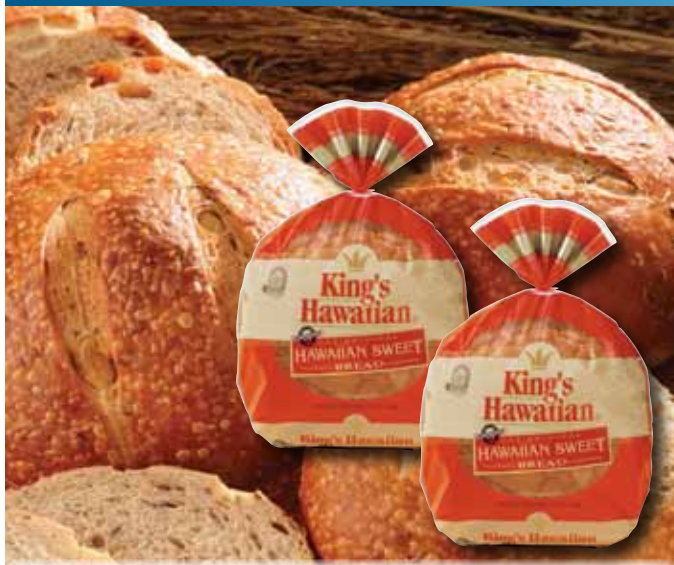
King's Hawaiian Bread 16-Oz.