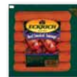
Assorted Eckrich Smoked Sausage 12 To 16-Oz.