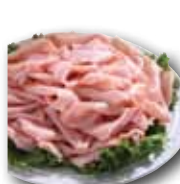
Maple River Ham Per Lb.