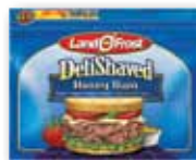
Assorted Land O'Frost Deli Shaved Meats 7.5 To 10-Oz.